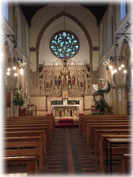
Our School Parish, St Catherine of Alexandria- just next to school.